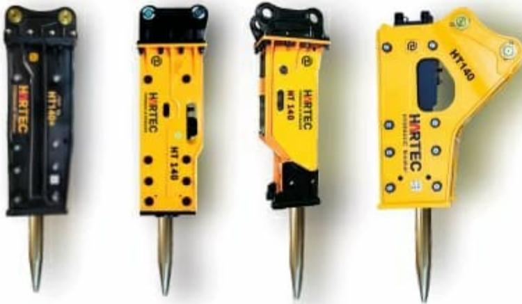
TOP TYPE (PLUS) TOP TYPE BOX TYPE SIDE TYPE