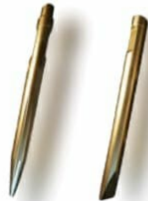
X - TYPE CHISEL FLAT CHISEL